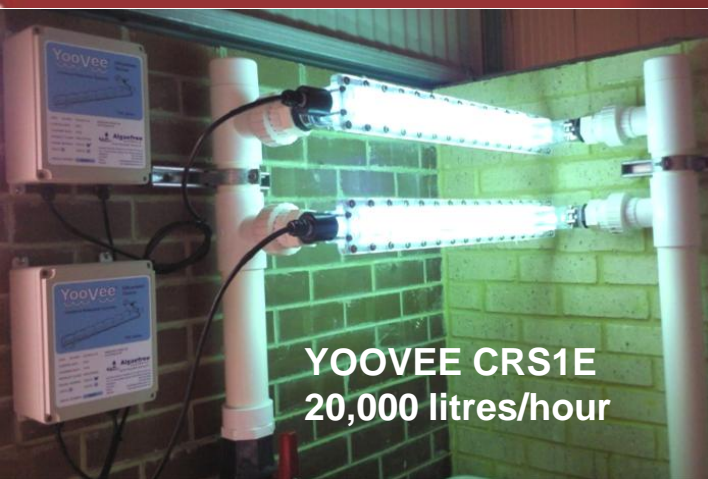
YOOVEE CRS1E 20,000 litres/hour

Seadragonz Swim School is one of WA's most awarded swim schools with many Swim Australia and Environmental Awards to their credit.